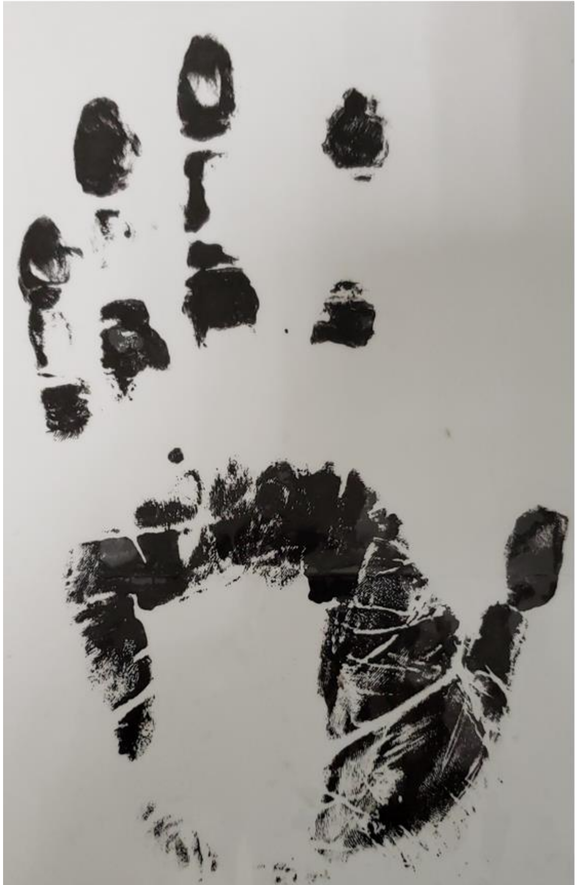
Adult female gorilla handprint

explorations of the animal world through connections to literature